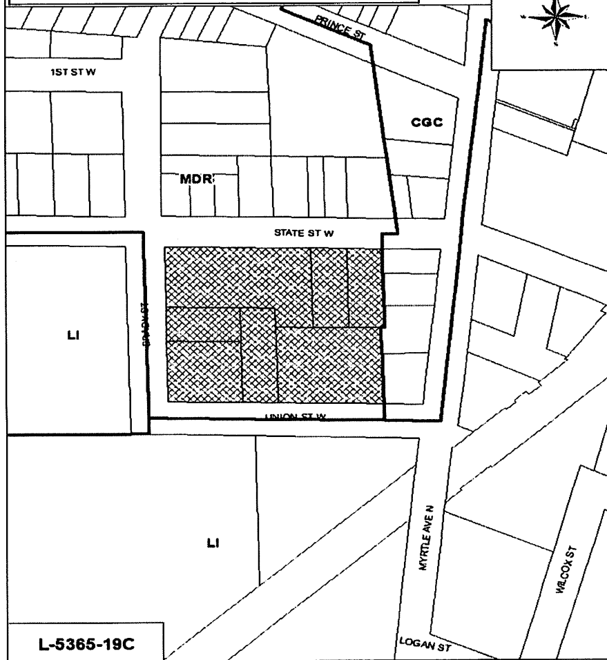
Pre-Adoption of L-5365-19C Land Use Map